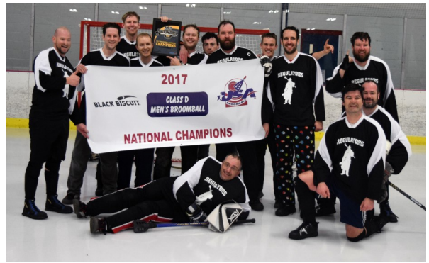
REGULATORS DISTRICT OF COLUMBIA Class D Men's Broomball