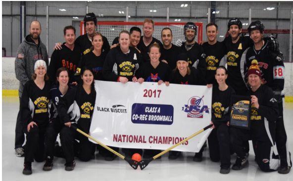
REVEL'S REPAIR, LONG LAKE, MN Class A Co-Rec Broomball