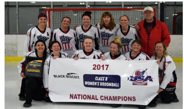
MN FORCE, MINNEAPOLIS, MN Class B Women's Broomball