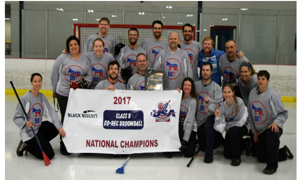
BI-CURIOS, DISTRICT OF COLUMBIA Class B Co-Rec Broomball