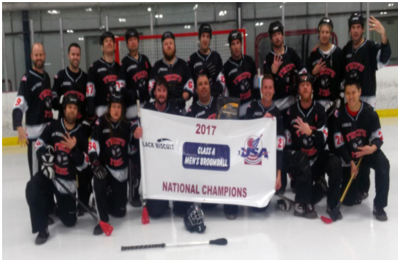
FRED'S TIRE, STILLWATER, MN Class A Men's Broomball