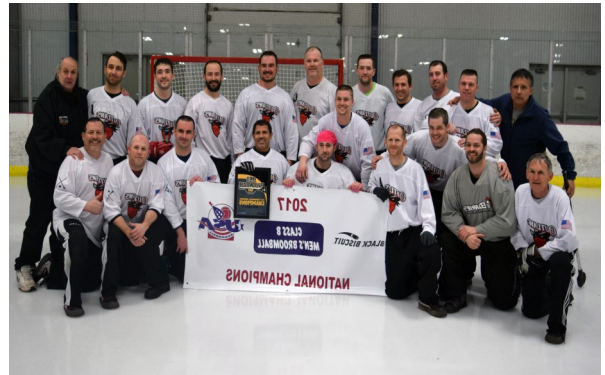
SYRACUSE OUTLAWS, SYRACUSE, NY Class B Men's Broomball