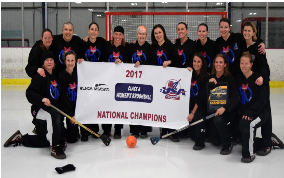
MN UNITED, MINNEAPOLIS, MN Class A Women's Broomball