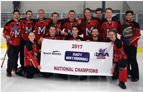
MIAMI U, OXFORD, OH Class C Men's Broomball