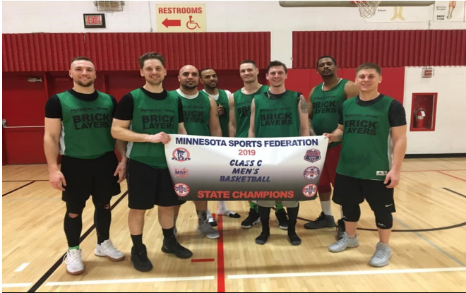
C Men's Basketball State Tournament