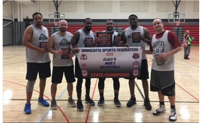
D Men's Basketball State Tournament