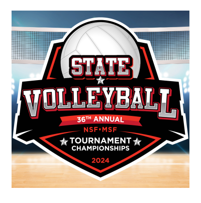
AFFILIATED WITH Minnesota Youth Basketball Association National Softball Federation