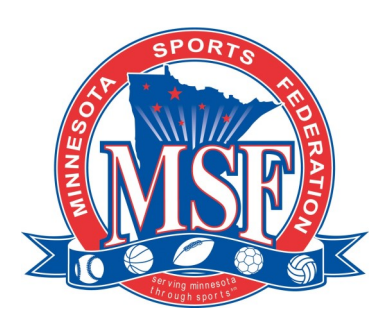
MINNESOTA SPORTS FEDERATION