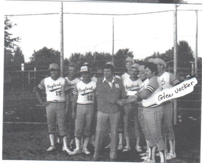
16 Team molson Tournament champs. 1981