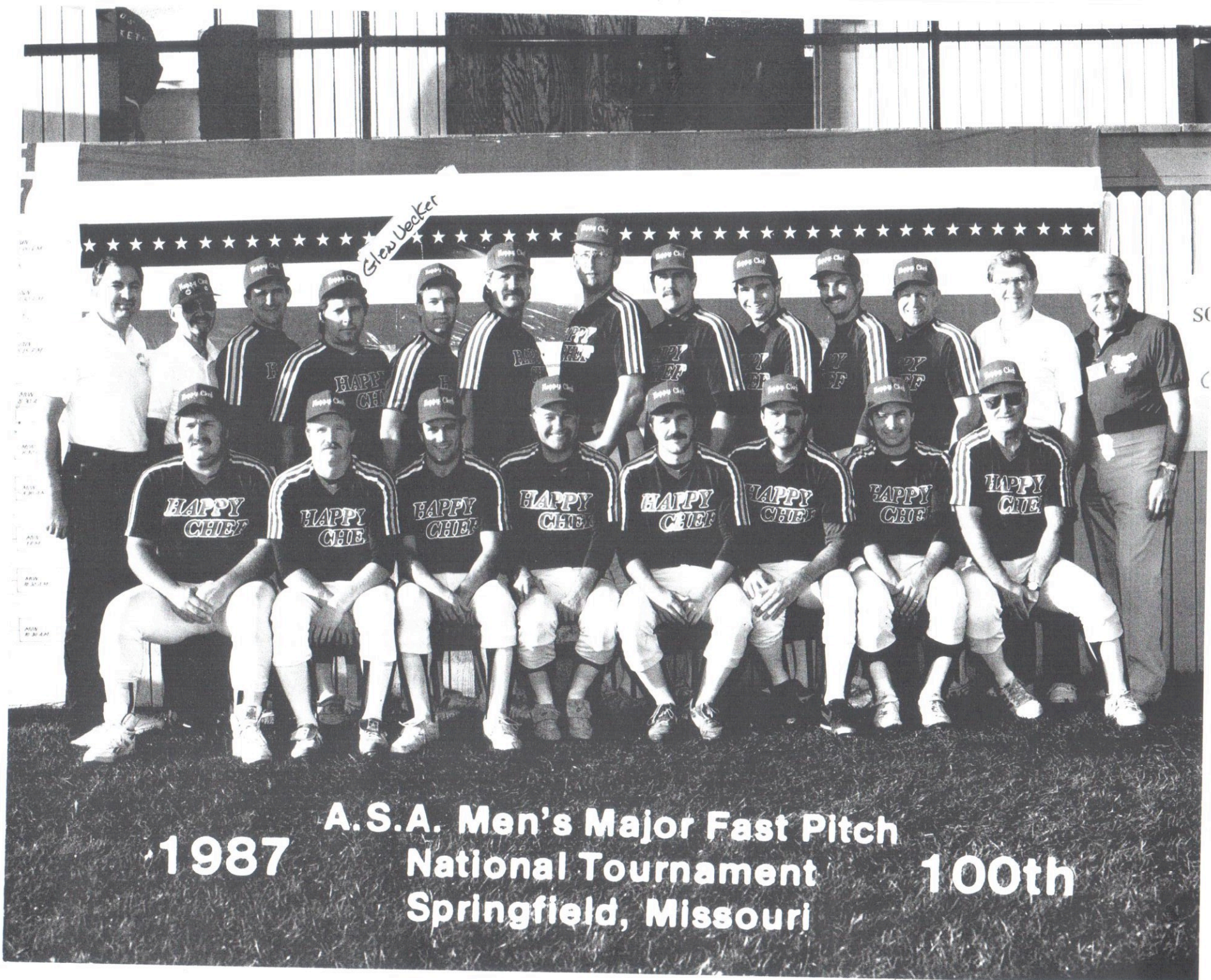
1987 A.S.A. Men's Major Fast Pitch National Tournament 100th Springfield, Missouri