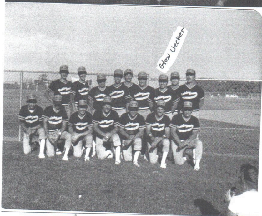
ISC League STATE AA Runner-up 1984