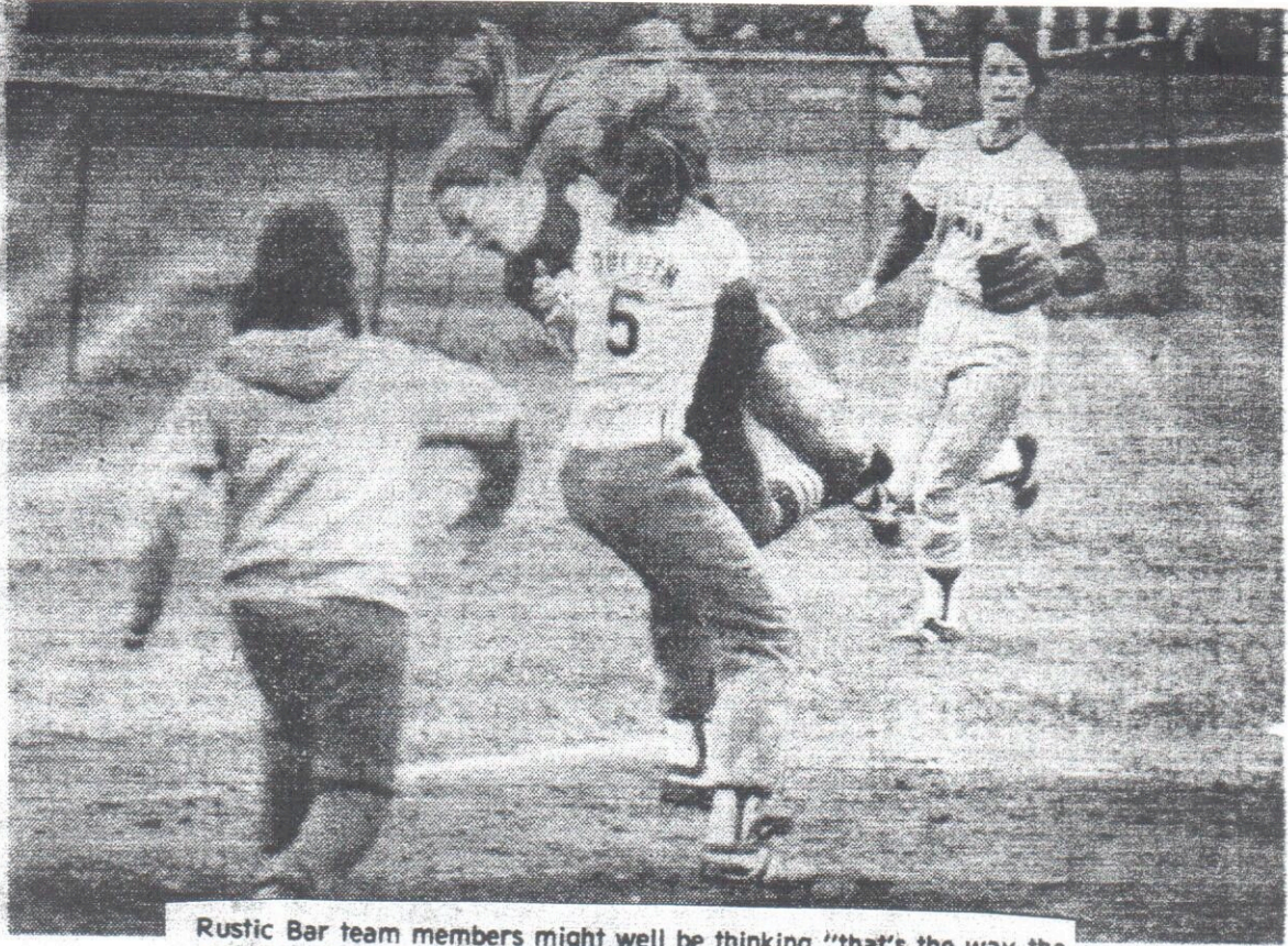
Rustic Bar team members might well be thinking "that's the way the cookie crumbles" during this play in the opening round of the Waltman-Tessier Memorial Softball Tournament Saturday morning at Wheeler